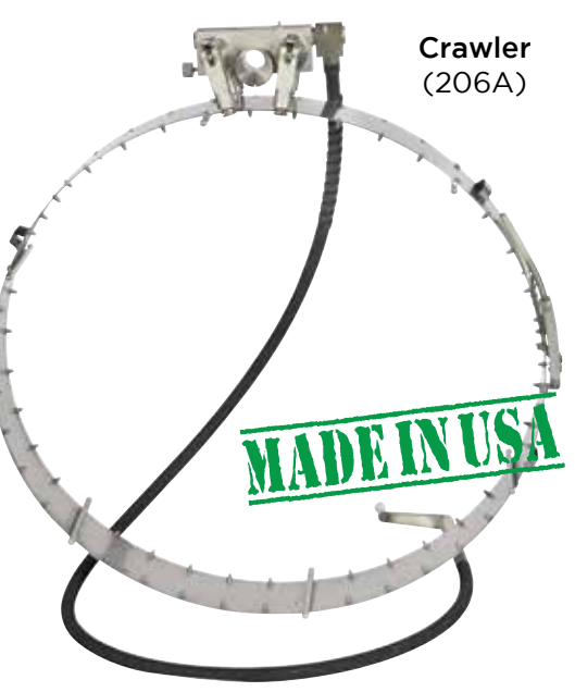
Beveling Band (206D)